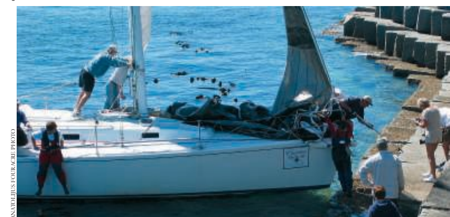
On Leg 10 from Victoria to Nanaimo the combination of very light wind and current almost forced Bob Brunius's J120 Time Bandit onto the breakwater. It took several attempts and at least five minutes for the boat to clear herself, but eventually the main was backwinded and the boat backed off the concrete barrier with a huge cheer from the spectators.