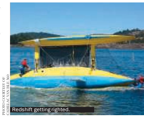
Redshift getting righted.