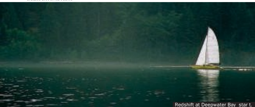
Redshift at Deepwater Bay start.