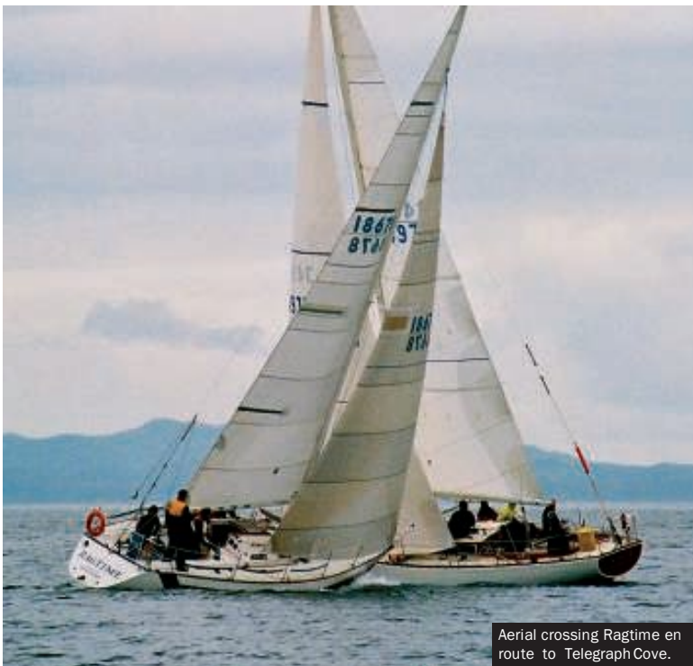
Aerial crossing Ragtime en route to Telegraph Cove.

The fourth Cadillac Van Isle 360 International Yacht Race will go down in the record books for non-stop action and thrills with fierce competition, broken boats, broken ribs, rescues and new speed records.