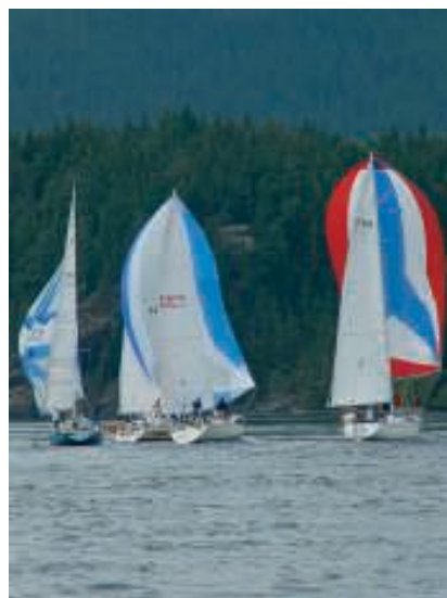
Boats battled the current a mile off the finish line at Eden Point on Leg Four, which pushed them everywhere but across. Boats bounced off each other in the light air and strong current and Flip, Flop and Fly ricocheted between the shore and the committee boat in its effort to complete the course.