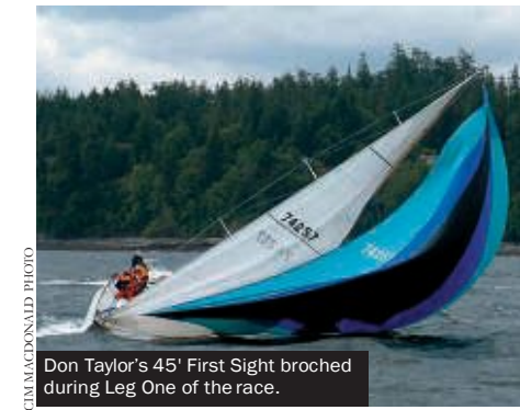
Don Taylor's 45' First Sight broached during Leg One of the race.