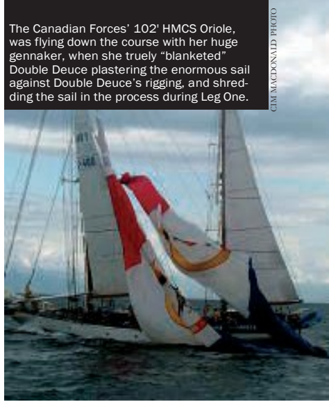
The Canadian Forces' 102' HMCS Oriole , was flying down the course with her huge gennaker, when she truly "blanketed" Double Deuce plastering the enormous sail against Double Deuce's rigging, and shredding the sail in the process during Leg One.